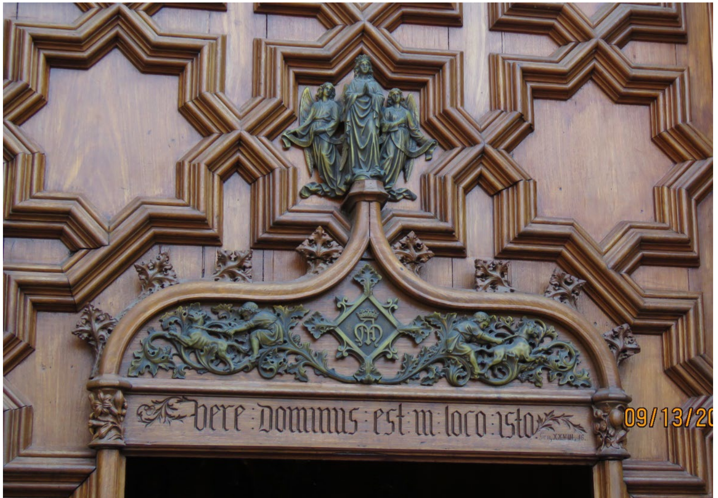
Carving & Brasswork over the entry door of the Barcelona Cathedral, Barcelona Spain