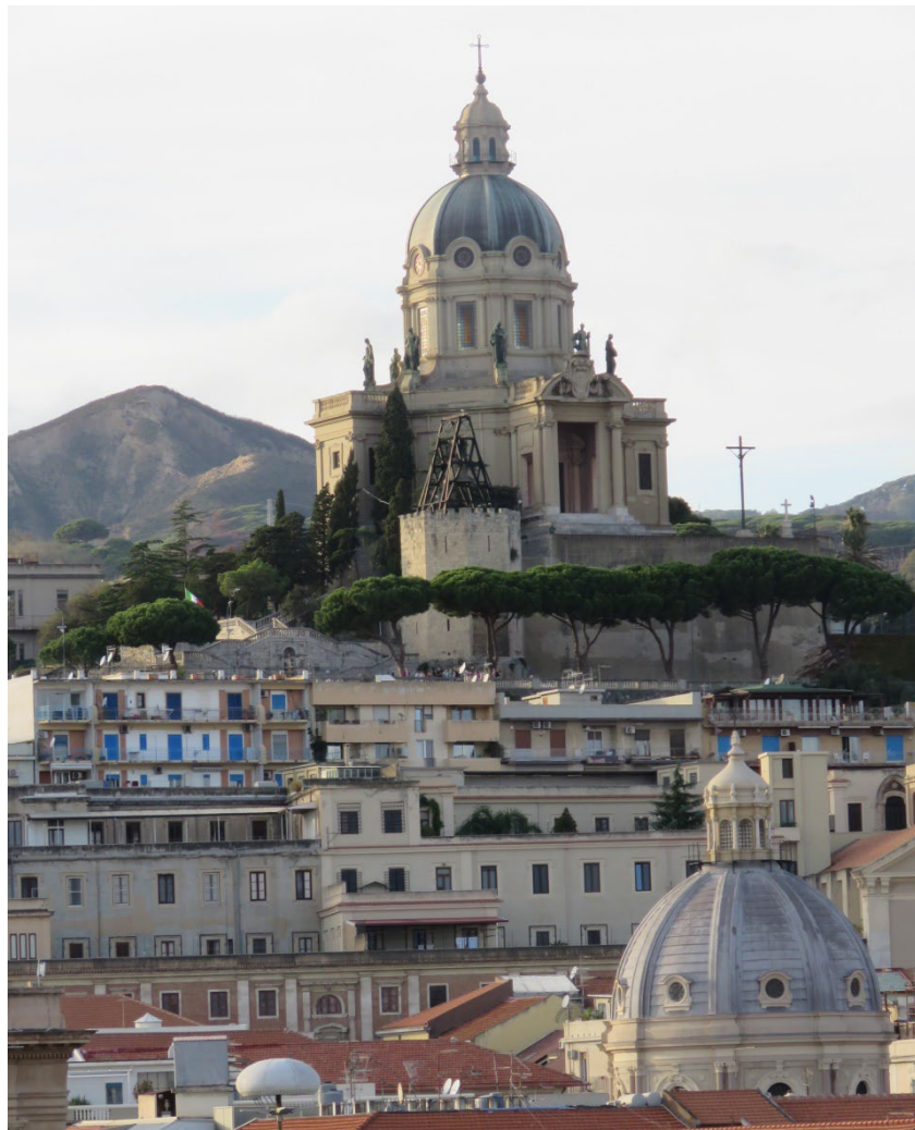
View of church domes in Naples Italy

~ January - March ~ Anno Societatis LVIII (2024) Issue #135