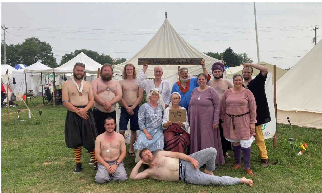
The Dragon's Claw camp at Pennsic LI, 2024