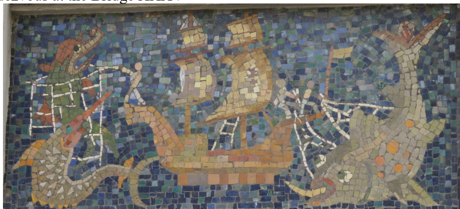
Mosaic from Stockholm